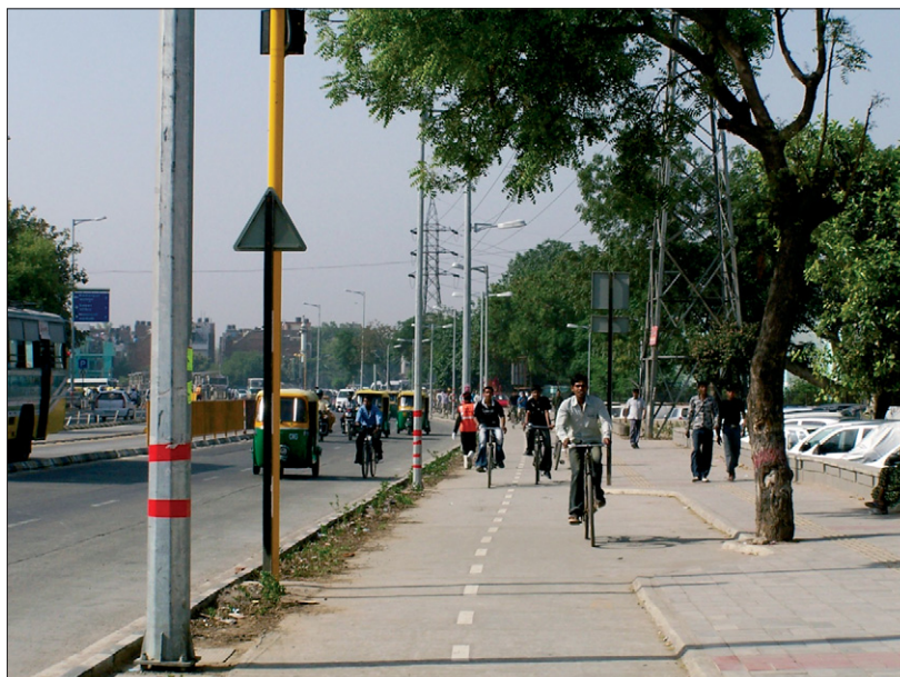
Figure 2: New bicycle facilities in Delhi, India

We showed the potential effect on the population distribution of body-mass index by modelling the effect of