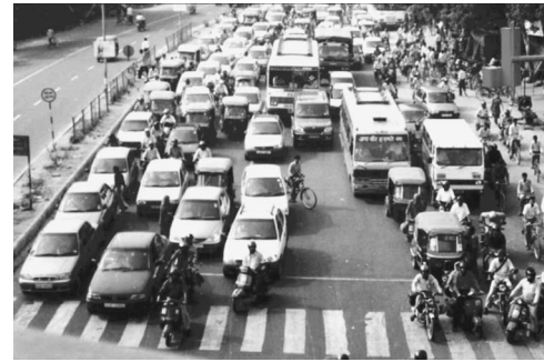
Fig. 2. Nonhomogeneous traffic

traffic data to solve traffic problems where nonhomogeneous conditions prevail. The underlying traffic flow theory of nonhomogeneous traffic is very different. However, using proper scientific methods, one may discover specific commonalities existing between the two theories.