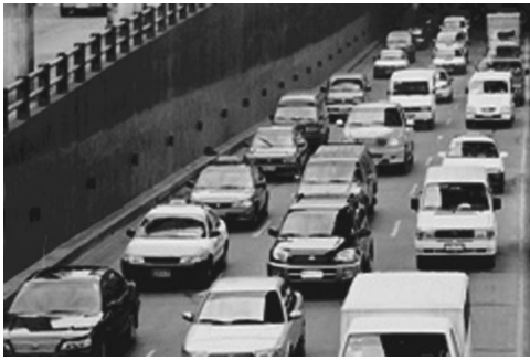
Fig. 1. Homogeneous traffic