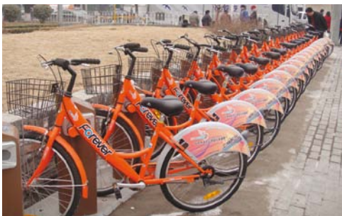
Figure 4: Free bicycle rental in Beijing

To ease the shrinking modal share, bicycle rental has entered the agenda of city government. Governments of Hangzhou, Beijing, Wuhan, etc., have initiated policies, including financial