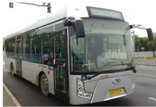
Figure 5: Electric Bus in Beijing

Units . 13 cities, including Beijing, Wuhan and Shanghai, were preliminarily selected for using electric vehicles in public transport, taxis, etc. (Figure 5). It is planned to popularise 60,000 new energy vehicles all over China by 2012, of which hybrid vehicles account for above 95%. The project’s launch ceremony in Wuhan in January 2009 marked a fresh era of new energy vehicle industrialisation in China. The higher cost of new energy vehicles will be subsidised by the Central and local governments.