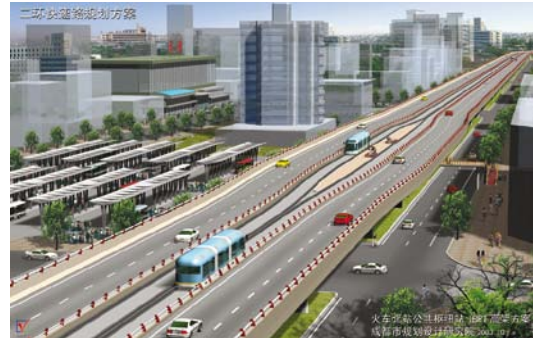
Figure 1: Chengdu: 2nd Ring Road Project

Shenzhen, Guangzhou, etc. It has shown obvious effects on green development of urban transport.